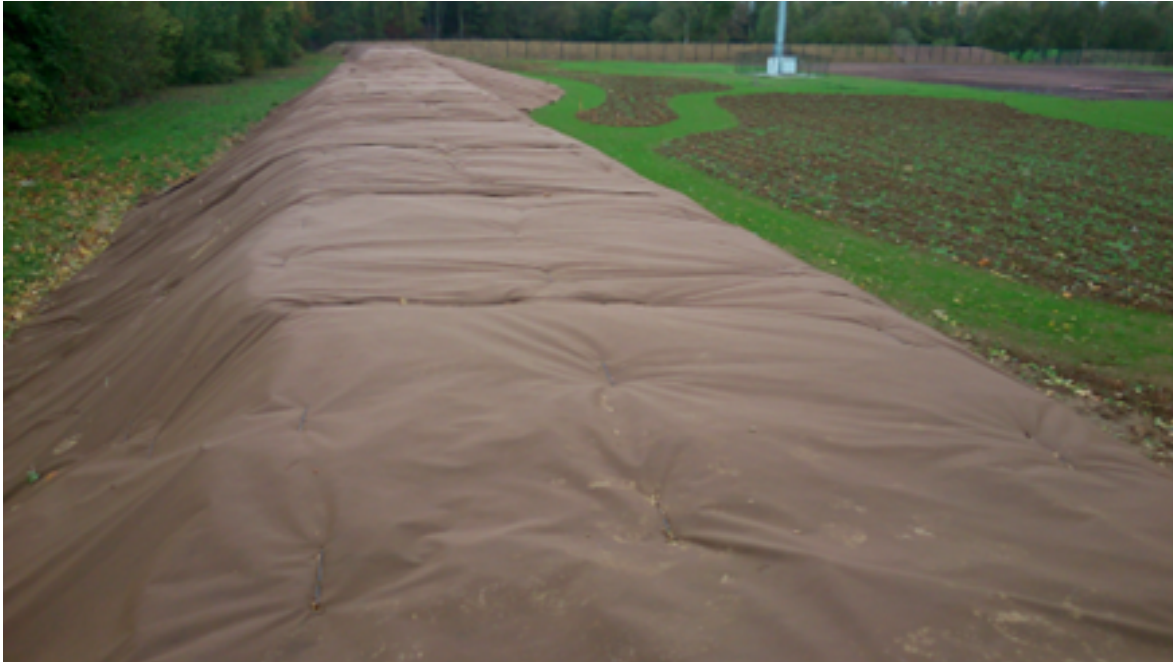
Biocompostable Weed Control Fabric Composition: Polylactic acid