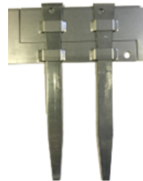
Galvanized finish Joining 2 lengths