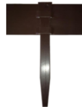
Brown finish Fixing stake