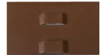
Corten Finish Fixing point