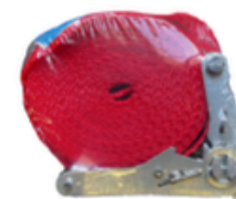
Polyester strap 6,50 m